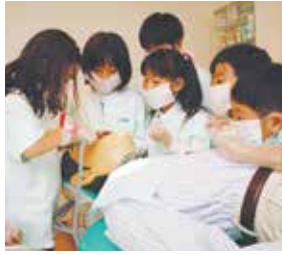
The Touch and Understand Toothbrushing Book with easy-to-understand 3D representations (left) and Kidzania Tokyo (right).