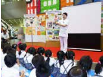
Teaching at a diet education event in Sumida-ku, Tokyo. Instilling healthy habits during childhood leads to better lifelong health.