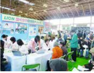
The Lion Foundation for Dental Health's Periodontal Disease Risk Examination Program provided examinations and instruction to 980 participants on November 24-25, 2012.